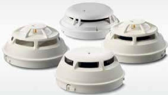
Data centers, telecommunications facilities, office buildings, or industrial production facilities – Cerberus PRO offers a detector for any application.

A comprehensive offering of standard detectors and advanced detectors with ASAtechnology ™ offer versatility to protect clean, dirty, or normal environments.